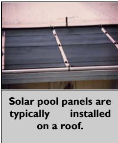
Solar pool panels are typically installed on a roof.

Solar heating is the most cost-effective way to heat any pool in any climate. The main design consideration is to have sufficient solar panel surface area to transfer enough heat to the pool during the day to offset night heat losses and thus steadily increase the pool's temperature.