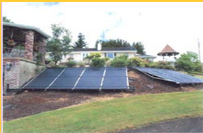
Eight 4x12 FAFCO SunSaver panels on GroundPro aluminum racks

ecosystems is the exclusive, master distributor for FAFCO Solar Pool Heating Systems for the Pacific NW, Hawaii, and several mountain states with 28 years of experience. Our interest is to help our dealers and their customers design and install solar systems that will perform well and provide 20+ years of trouble-free operation.