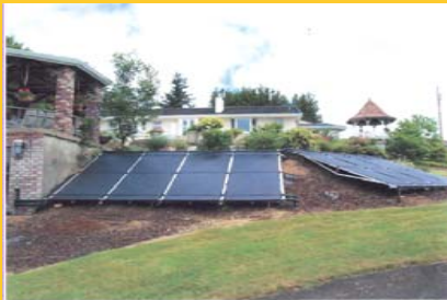
Eight 4x12 FAFCO SunSaver panels on GroundPro aluminum racks

ecosystems is the exclusive, master distributor for FAFCO Solar Pool Heating Systems for the Pacific NW, Hawaii, and several mountain states with 28 years of experience. Our interest is to help our dealers and you, their customer, design and install solar systems that will perform well and give 20+ years of trouble-free operation.